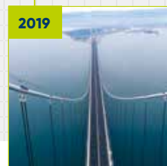
Canakkale Bridge (Turkey)