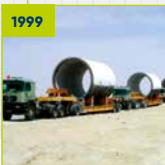
Great Man-Made River (Libya)