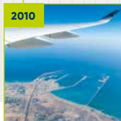
Ras Laffan Port Expansion (Qatar)