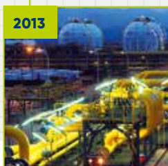
Gran Chaco (Bolivia)

We work together with partners who are leading providers in cathodic protection and integrity management. As well as remote monitoring and control for CP systems we offer control of pressure for water and gas pipeline networks, and monitoring of gas odorant. All hardware and software solutions are supported through our dedicated team.