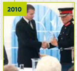
Queens Award for Enterprise