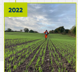
National Grid (UK)