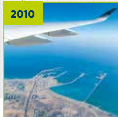
Ras Laffan Port Expansion (Qatar)