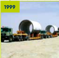
Great Man-Made River (Libya)