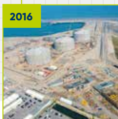
Dunkerque LNG Terminal (France)