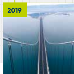
Canakkale Bridge (Turkey)