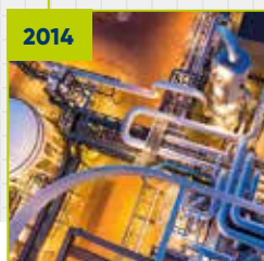
IBN Sina POM Plant (Saudi Arabia)