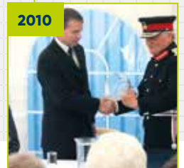
Queens Award for Enterprise