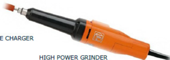
HIGH POWER GRINDER