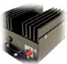
VEPAC IN-VEHICLE CHARGER